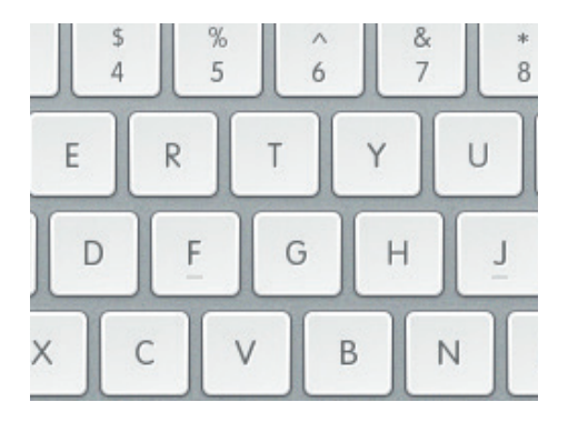
Application example: Computer keyboard